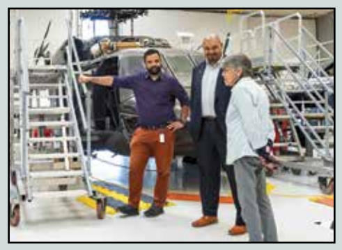
I had an incredible experience visiting Ft. Indiantown Gap National Guard Training Center and learning about the soldiers who keep us safe. This facility helps train more than 100,000 service members every year! Thanks for the tour!