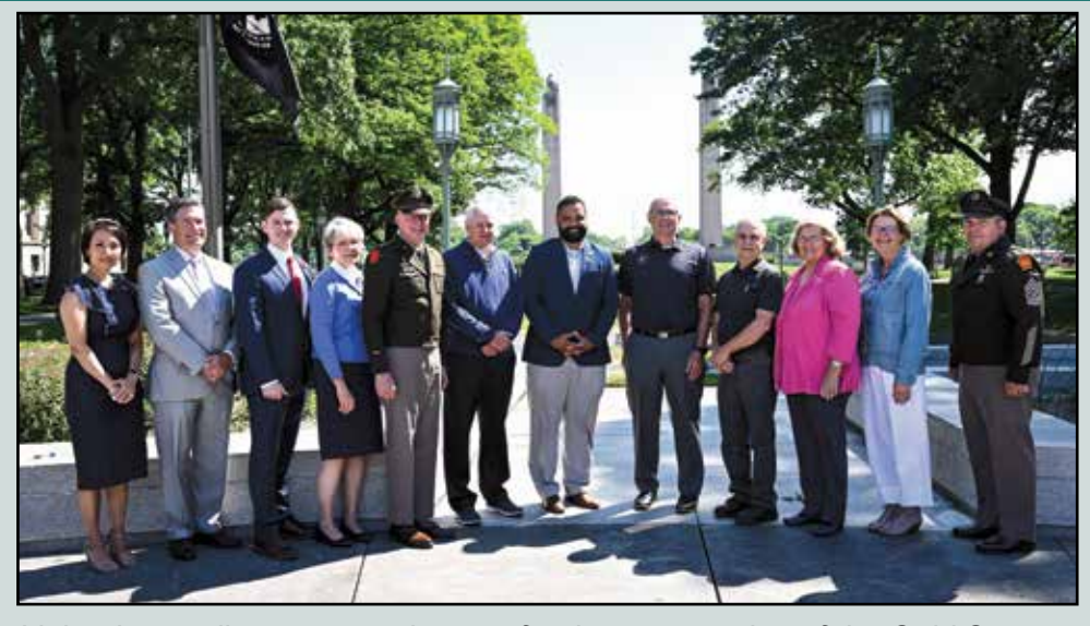
I joined my colleagues to advocate for the construction of the Gold Star Families Memorial Monument at the PA Capitol Complex. I'm proud to support legislation that would give Gold Star Families a place to honor their fallen loved ones.

I had an amazing tour of the Senior Life Center in Steelton! It was eye-opening to see firsthand how they serve our local community and provide essential support to our seniors. I learned a lot about their incredible work and discussed ways the state can assist them in continuing their impactful mission.